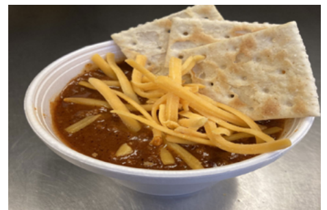
We offer a different soup every day during winter.

Our store continues to stock and sell cheese from Agropur. We are now offering gouda and pepperjack! We also make our own banana bread and Amish friendship bread for you to pick up and enjoy throughout your day.