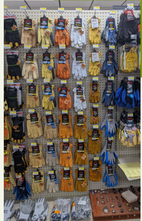
Our newest selection of gloves

Should you have any questions or want to talk about products or concerns you have, please reach out to your building center at the Hull Coop. We look forward to helping guide in you in your next project!