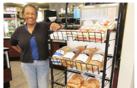
Hull Coop C-Store new outlet for Casey's Bakery, Sioux Center.

We continue to be grateful for your commitment to Hull Cooperative! Stop by the C-Store and say hello the next time you're hungry. We look forward to seeing you then!