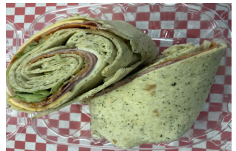
Sub or Turkey Club Wraps—new at the Hull Coop C-Store.

THREE DIFFERENT KINDS OF SALADS (POTATO, SPRING, AND COLESLAW)